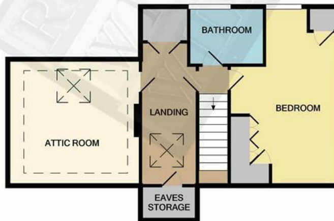
1ST FLOOR APPROX. FLOOR AREA 527 SQ.FT. (49.0 SQ.M.)

TOTAL APPROX. FLOOR AREA 1551 SQ.FT. (144.1 SQ.M.)