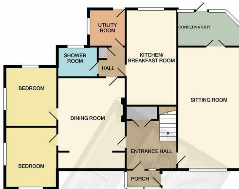
GROUND FLOOR APPROX. FLOOR AREA 1024 SQ.FT. (95.1 SQ.M.)